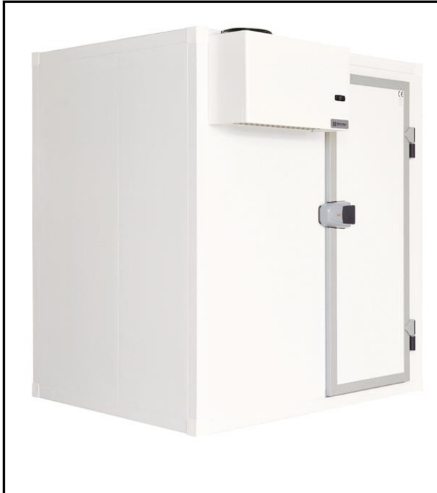
102087 (CRF2824B20N) Cold/Freezer Room 2430x2830 th.100mm, included Unit